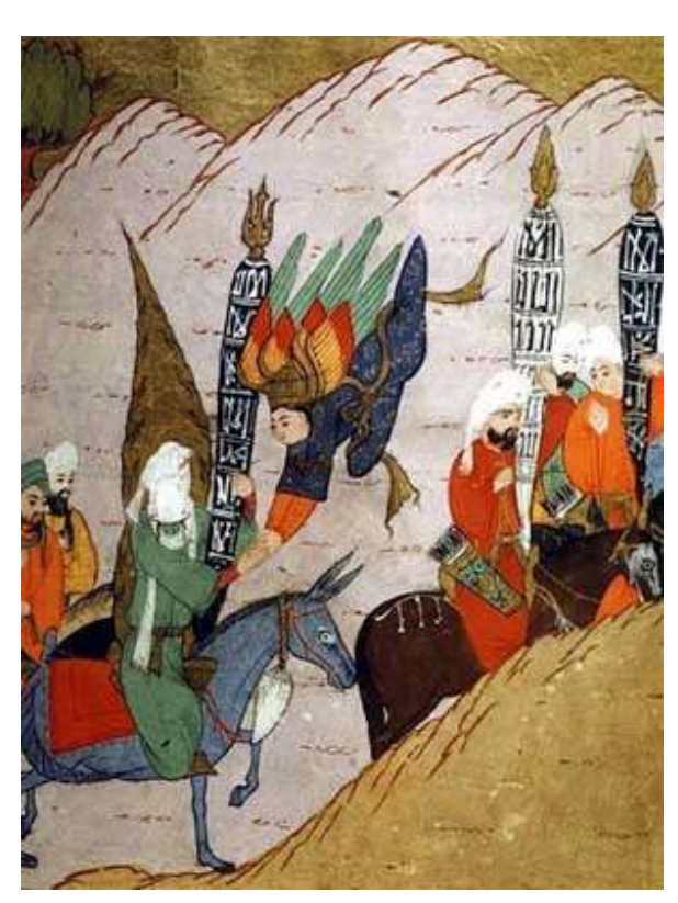
Why do you wrong your folks. Why do you wrong your nation. Why don't you turn in repentance. Why don't you slay your sins. Why don't you ask for forgiveness. Why don't you ask for mercy. Why don't you discard your darkness! O mortal!

Why don't you discard your darkness! O mortal!